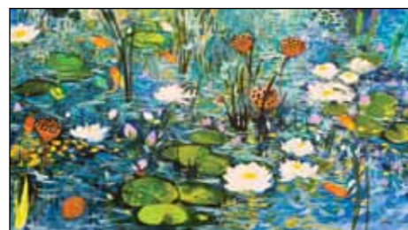
Karen Windle, Blue Pond