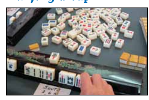
Tuesdays 1.30pm - 3.30pm. Free. No bookings required.