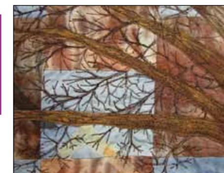
Sue Buxton, (detail)

The amalgamation of painting and drawing students with the textile students gave both classes the chance to further expand their knowledge and discover new mediums. The students were from different backgrounds, cultures and stages of life with their reasons for studying Visual Arts quite varied. Their common theme is a desire to learn and experiment.