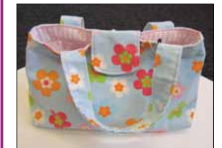
Ann Smith, Flower Bag , Textiles

Try us for your next gift need, or for something special for yourself.