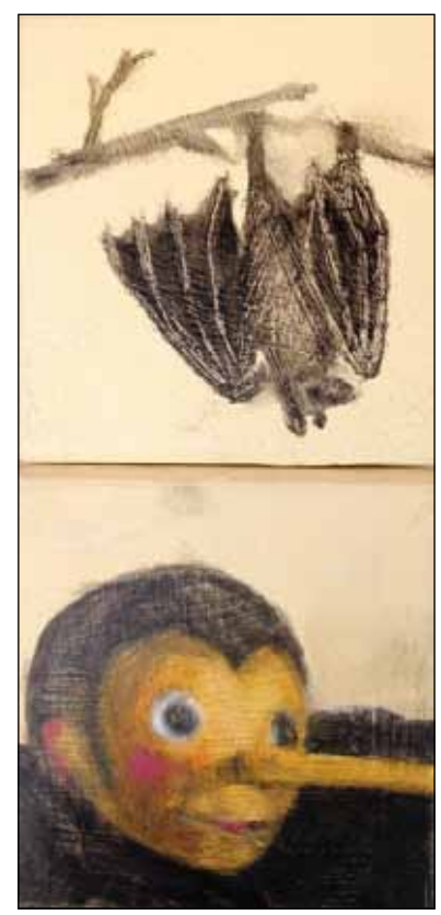
Kveta Deans, Pinocchio's Nose (block series#1) oil on wooden block

platforms, they try to create the perfect static condition in an ever changing universe, seeking security within limitations. Measured, ordered, confined and strong, Squared explores both the beauty within and the infinite possibilities outside the square.