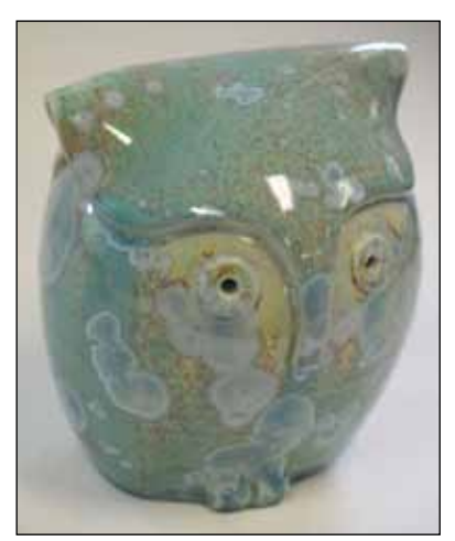
Fran Kernich, ceramic owl, crystalline glaze