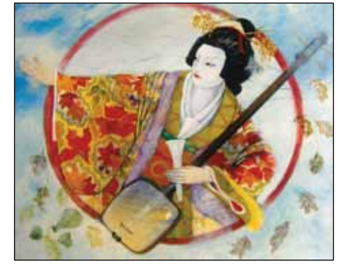
Hazel Harding, Stepping Out Series - Autumn, oil on canvas

Several family pets have been included in the exhibition, except of course the monkeys and the crocodile.