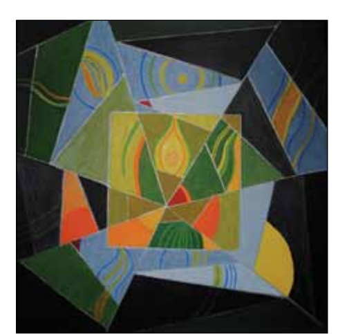
Anna Mycko, Squared Away #2, acrylic, coloured pencil and ink on canvas