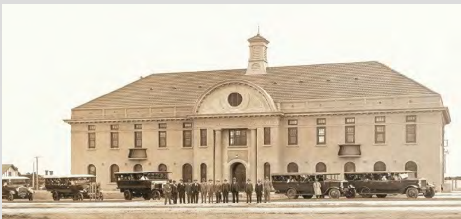
Above: Burnside Town Hall 1928