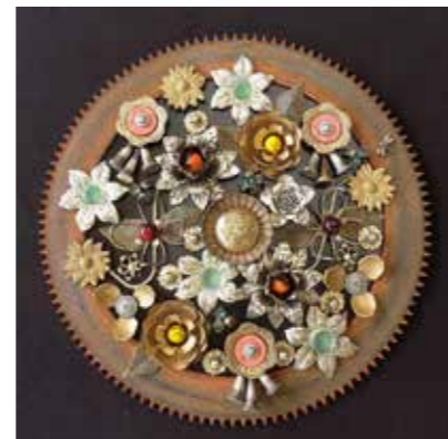
Iron Canvas, Circle of Giving

An exhibition of upcycled, recycled and re-used objects to create something new is open to all artists for the Pepper Street SALA exhibition in 2020. All art forms created around an upcycled, recycled and found object theme are welcome. Applications are now being accepted by the selection panel.