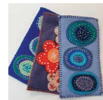
Jenny Fyffe, Sunglass Case