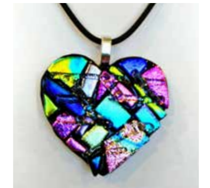
Jaynanne Fullgrabe, dichroic heart