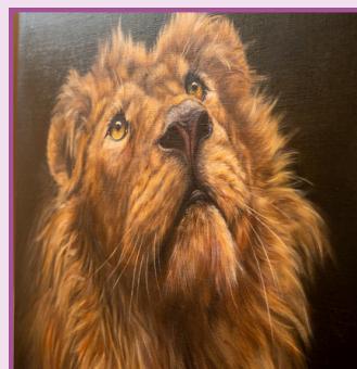
Elise Leslie-Allen, King , Oils

Accepting 2D and 3D artwork created around the theme of 'wildlife'. Artists are encouraged to let their creativity soar. This theme may suggest non-domestic fauna and flora, the use of wild materials, the interpretation of personality or environment.