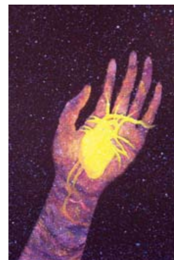
Heart Nebula, Acrylic

An exhibition of mixed media & poetry by Audrey Emery