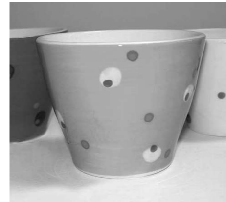
Spotty Cups, Erin Lykos