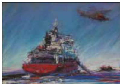
Jan Monks, Antarctic Support

Collective Inspirations by Off the Couch Art Studio will stimulate your senses, feed your soul and may also inspire you in your own creative expression.