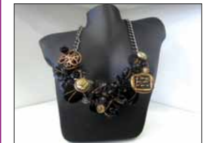
Melanie Steadman, Dark Flower, Necklace

Try us for your next gift need, or for something special for yourself.