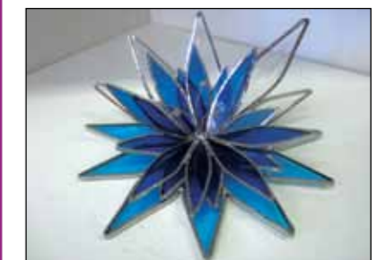
Kailasha Malcolm, Native Flower