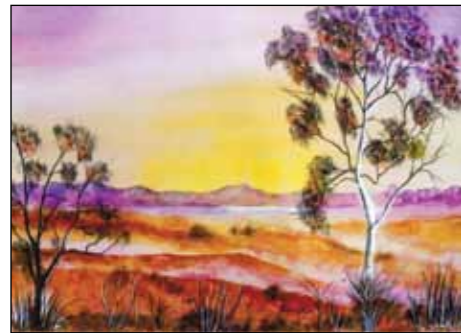
Ghost Gum at the MacDonnell Ranges